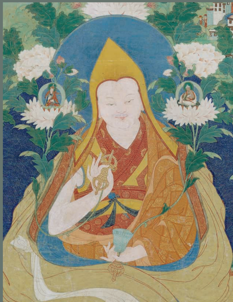
LIFE STORY OF THE FIFTH DALAI LAMA